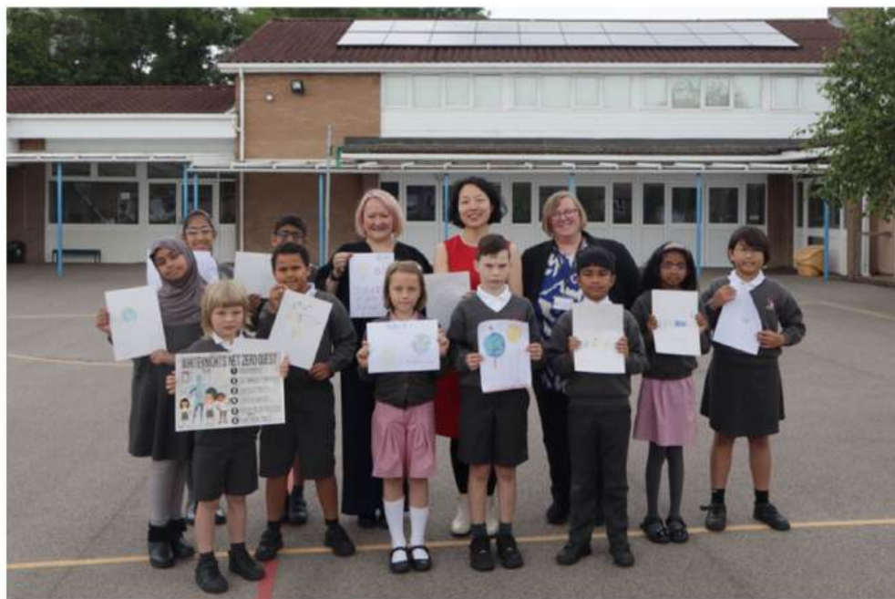
Climate Minister and Earley MP with Whiteknights Primary School pupils and headteacher