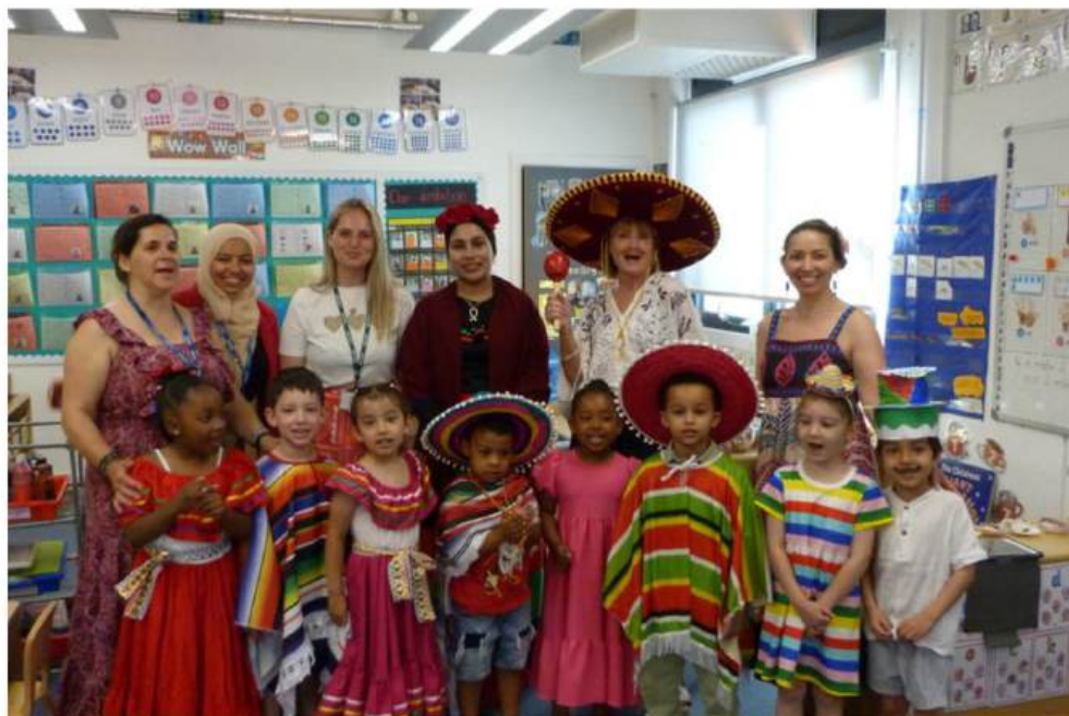
Viva el Arte day at Watling Park School