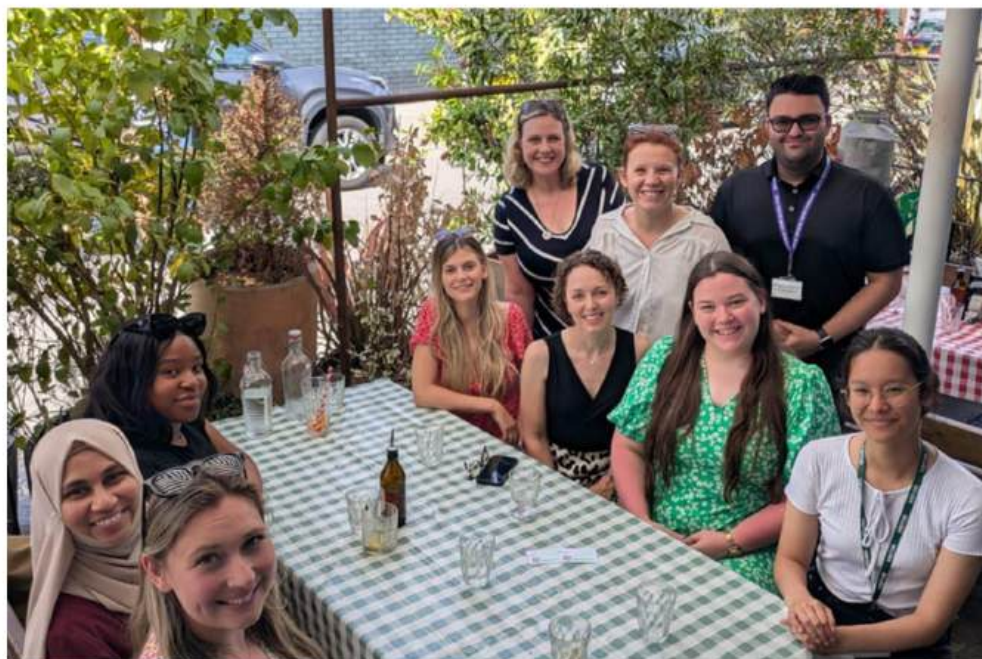
Our newly qualified teachers, who trained in a BPET school, with their mentors.